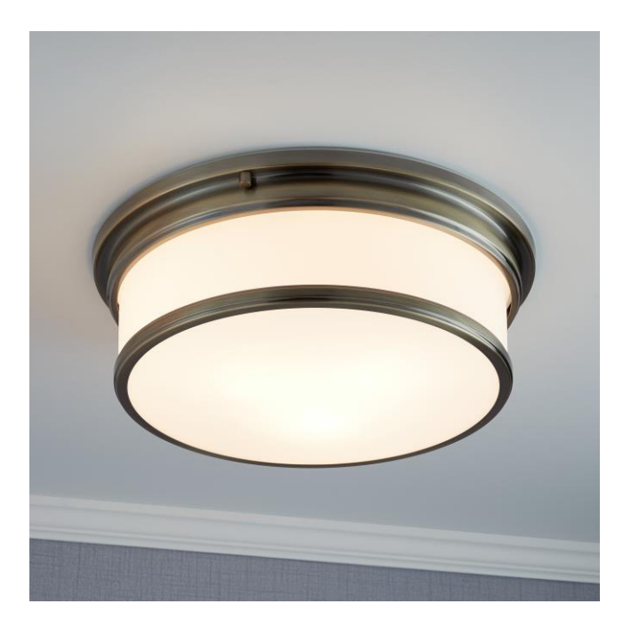
CODES/STANDARDS UL 1598 / CSA C22.2 No 250.0