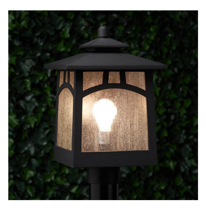
CODES/STANDARDS UL 1598 / CSA C22.2 No 250.0