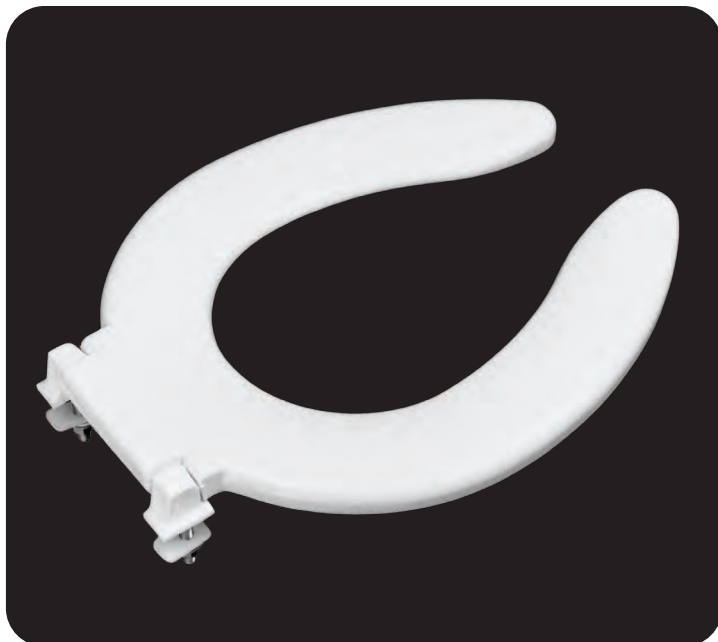
527 Elongated (Open front seat less cover)

For Perma-Check® Antimicrobial and Flame Retardant Features.