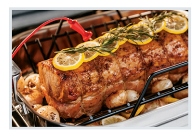
PowerPlus® Temperature Probe Ensures great results the first time. Set and monitor dish temperature with the PowerPlus® Temperature Probe.