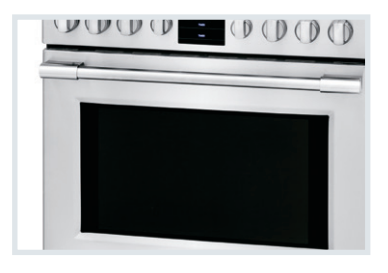
Smudge-Proof™ Resists fingerprints and cleans easily.