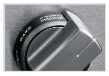
PowerPlus® Preheat With PowerPlus® Preheat, your oven is ready in a few minutes for a powerful start to every delicious meal.