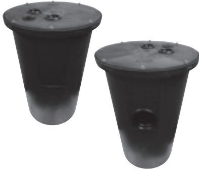
18" x 22" 22 Gallon Capacity