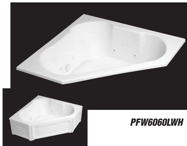
Shown with optional removable apron (PFSK6060)