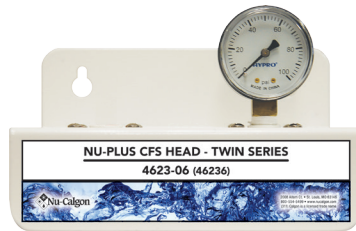
Twin Manifold Parallel Flow 4623-02 or Series Flow 4623-06