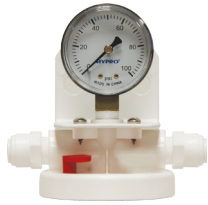
Single Manifold 4623-01