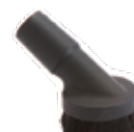
2NYE6 3 in. Plastic Round Brush Tool (use with hose only)