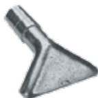
6X886 7 in. Metal Gulper Tool (use with hose only)