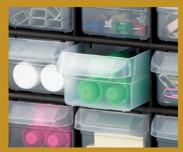
Unbreakable see-through drawers feature finger grip drawer pulls