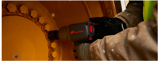
Assembly and Disassembly of machinery and heavy equipment

An air motor that's 16% more efficient than its predecessor and an easy-to-clean inlet screen means less downtime, better tool performance, and less money spent on compressed air