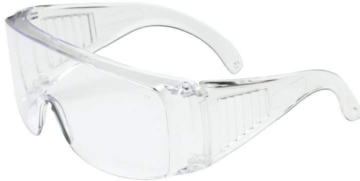
Polycarbonate lenses block 99.99% of the sun's ultraviolet rays. This ultraviolet protection has already been incorporated within the lens material when the lenses are being produced.