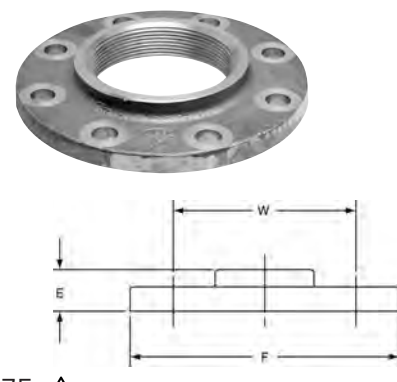
NOTE: Dim. B = Tube Stop to Flange Face