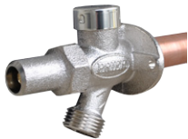
C-244 Loose Key Design