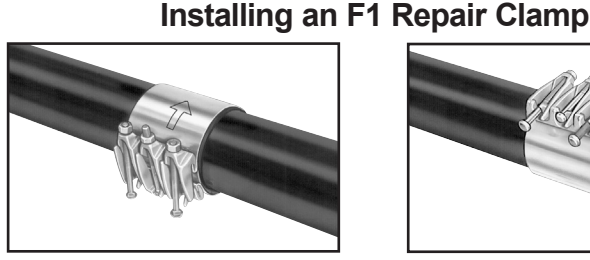
Hook the middle bolt into the receiver lug and tighten the nut until the bolt is secure.

1. Repair clamps are not designed for pipe restraint. Make sure proper restraint is applied when required. 2. ALWAYS RECHECK TORQUE AND PRESSURE TEST FOR LEAKS BEFORE BACKFILLING. 3. Backfill and compact carefully around the clamp according to the pipe manufacturer's instructions. 4. Tighten all sections of a multi-section clamp evenly and equally to the recommended torque.