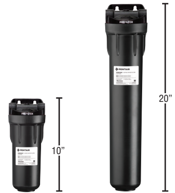
E-10 PREFILTER (9795-80)