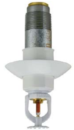
SLEEVE & SKIRT