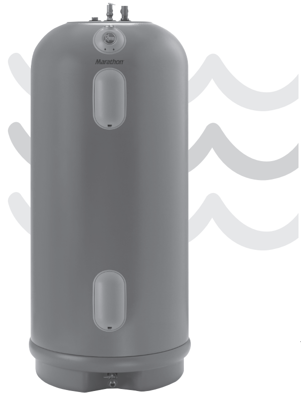
Marathon Heavy Duty 75, 85 and 105-Gallon Capacities 240 Volt AC/Single Phase Electric

Safety and Construction | These products are design certified by Underwriters Laboratories (UL) to meet UL safety standards and UL/NSF 005 as electric storage tank water heaters. All models are North Carolina and Massachusetts Code compliant. Certified for 150 PSI maximum working pressure.