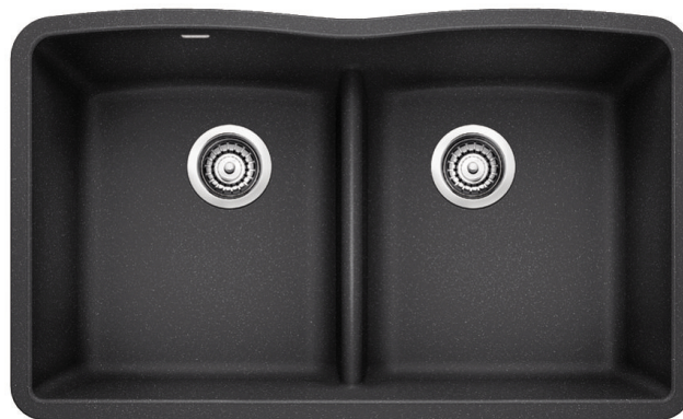
Model 442075 shown