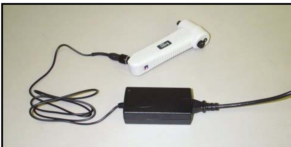
The Lmic connected to the universal 110-240V AC charger

Connect the charger lead to the rear connector of the Lmic and connect the charger power lead to the 240V AC supply. The Lmic can then be charged overnight. An optional accessory is the car cigarette lighter adapter that can also be used to charge the batteries.