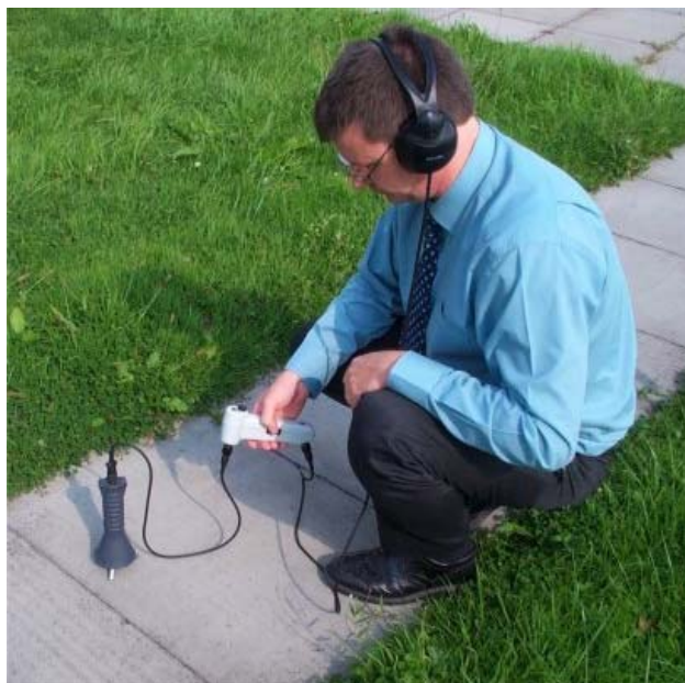
The Lmic in use

The Lmic is rugged and showerproof (to IP65) but contains electronic circuitry and should be handled with care. It should be kept clean and dry and where necessary cleaned with a damp cloth; abrasive materials must not be used.