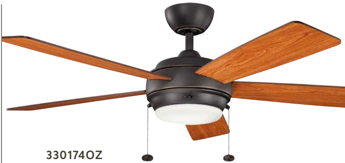
330174OZ Olde Bronze® Finish Etched Cased Opal Glass Cherry Blades