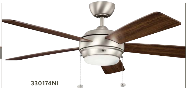
330174NI Brushed Nickel Finish Etched Cased Opal Glass Walnut Blades