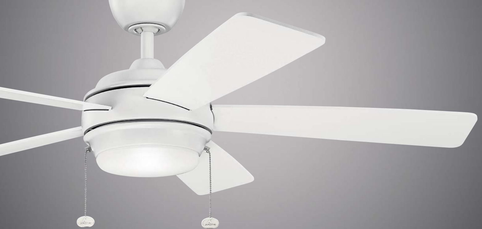
Shown: 330174MWH Matte White Finish, Etched Cased Opal Glass with Matte White Blades