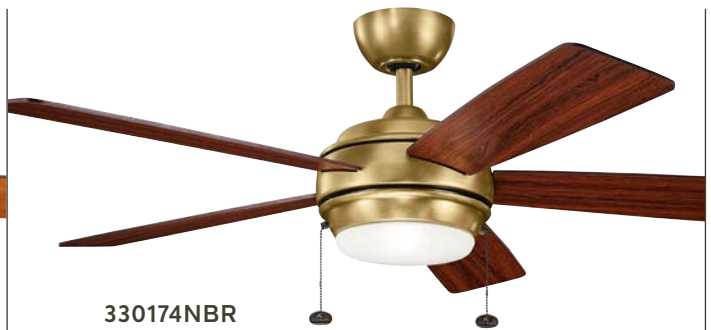
330174NBR Natural Brass Finish Etched Cased Opal Glass Dark Cherry Blades