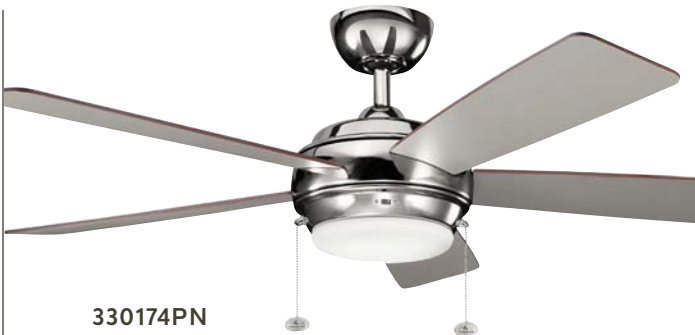
330174PN Polished Nickel Finish Etched Cased Opal Glass Silver Blades