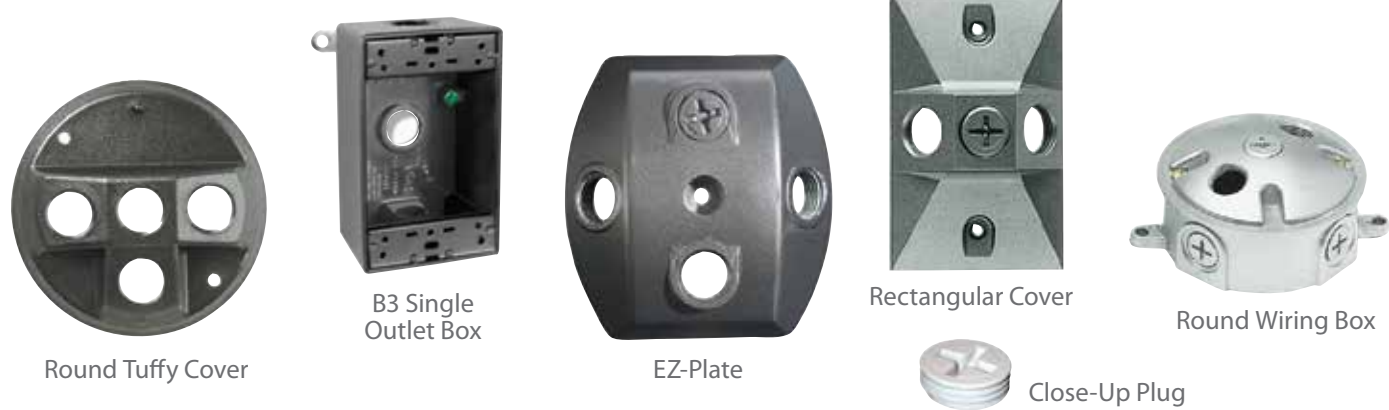
Round Tuffy Cover