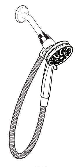
Handshower with Bracket & Hose