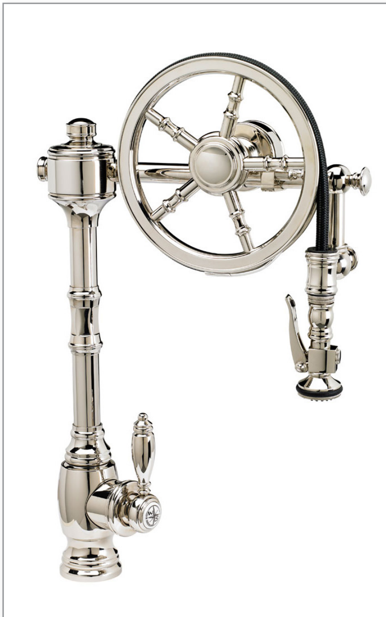
Finish Shown - Polished Nickel