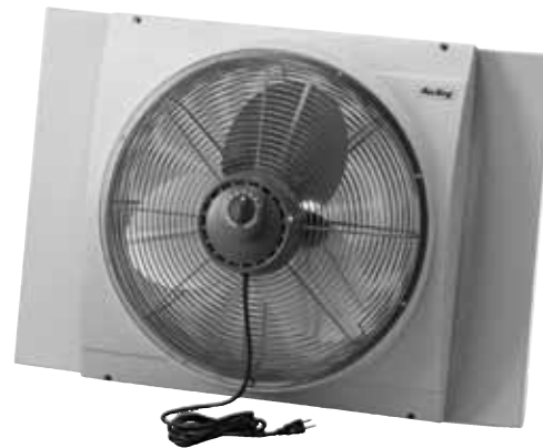
Whole House Window Fan 9166