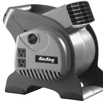
Pivoting Utility Blower 9550