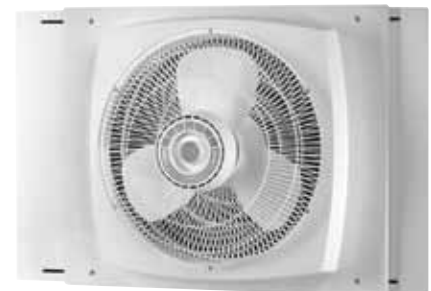
Window Fan 9155