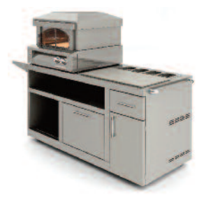
Pizza Oven Cart