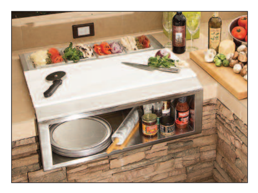
Pizza Prep and Plating Center

Plate shelf for storing plates, pizza pans, spices and other necessities. Convenient removable plastic cutting board and ice-cooled pan rail with NSF food pans for pizza toppings and other condiments. Also ideal as a raw bar, martini, and wine rail. Model: APS-30PPC