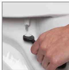
STA-TITE® SEAT FASTENING SYSTEM™