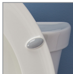
SUPER GRIP BUMPERSTM