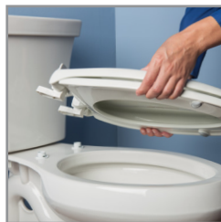
EASY REMOVAL OF SEAT FOR THOROUGH CLEANING