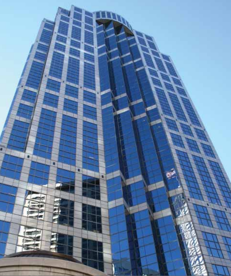
HIGH RISE COMMERCIAL BUILDINGS