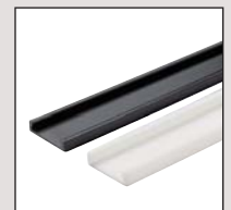
36" Plastic Track