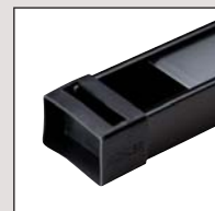
U-Channel with Diffuser