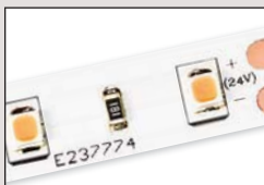
WH White Shown in Standard Output