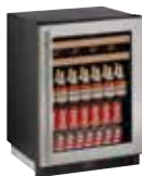
STAINLESS FRAME (LOCK)