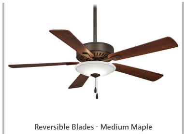
Reversible Blades - Medium Maple