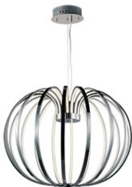
E24524-PC Argent LED Pendant