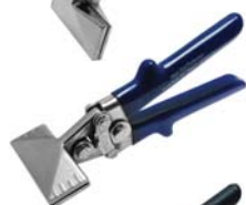
87-86553 (86553) Seamer – Straight