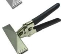
87-FCTMS6 (FCTMS6) Seamer – Straight