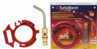
0386-0574 (TDLX2003B) Air/Acetylene Torch Kit w/Carrying Tote – Self-Igniting