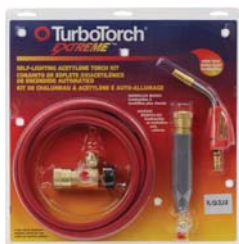
0386-0836 (PL-12ADLX-B) Air/Acetylene Torch Kit – Self-Igniting