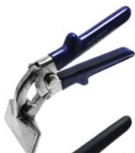
87-86552 (86552) Seamer – Offset