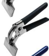
87-FCTMS2 (FCTMS2) Seamer – Offset