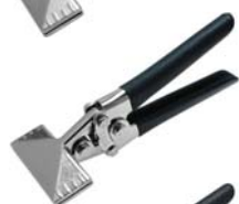
87-FCTMS1 (FCTMS1) Seamer – Straight