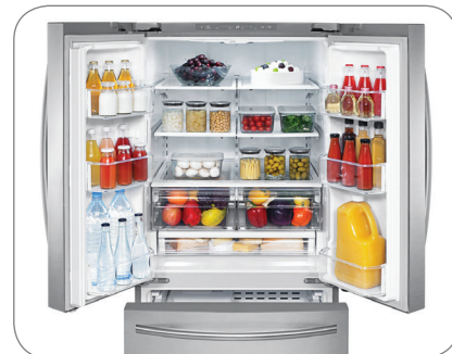
French Door Design