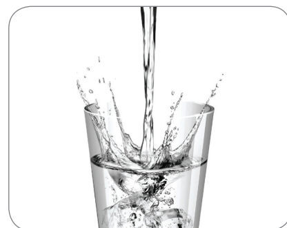
Internal Water Dispenser in Refrigerator