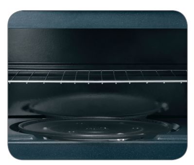
Ceramic Enamel Interior

Fingerprint Resistant Black Stainless Steel