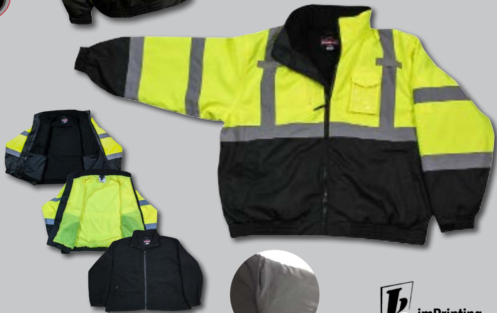
REMOVABLE FLEECE JACKET with LINED SLEEVES