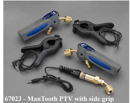
67023 - ManTooth PTV with side grip

The YELLOW JACKET ManTooth-PTV (67023) shown below provides the full set for high and low side readings which includes dual non-tethered pressure/temperature gauges, two wired temperature clamps, and one interchangeable vacuum gauge. The single ManTooth- PTV (67021) can be combined with an