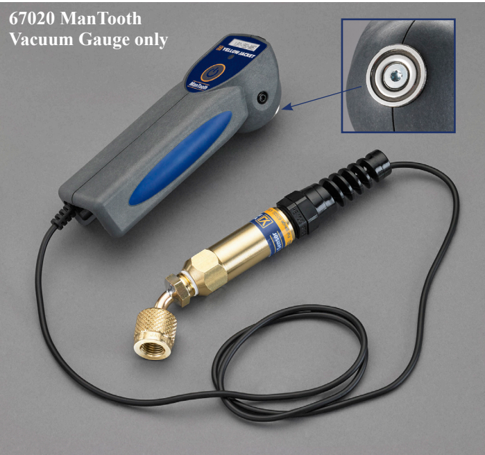
67020 ManTooth Vacuum Gauge only