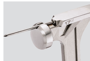
Magnetic Nail Set