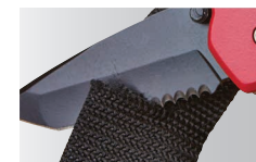
Ideal for Piercing & Tearing