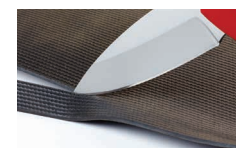
Ideal for Controlled Slicing