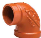
No. 145 Female NPT or BSPT Threaded x Groove 90° Elbow