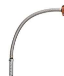
VicFlex™ Series AH1-CC Braided Flexible Hose with Captured Coupling (Refer to publication 10.95 )

ALWAYS REFER TO ANY NOTIFICATIONS AT THE END OF THIS DOCUMENT REGARDING PRODUCT INSTALLATION, MAINTENANCE OR SUPPORT.