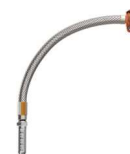
VicFlex™ Series AH2-CC Braided Flexible Hose with Captured Coupling (Refer to publication 10.85 )