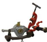
RG2100 Roll Grooving Tool