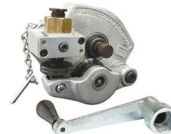
RG1 Manual Roll Grooving Tool (Refer to publication 24.01 )