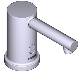
M•Power™ Align® Style Electronic Soap Dispenser