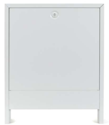
Fully assembled cabinet