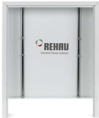
Coverplate and door removed

*Removable coverplate below door temporarily extends cabinet opening to the floor (27 in / 69 cm).