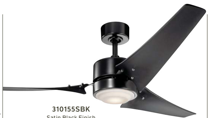
310155SBK Satin Black Finish Etched Cased Opal Glass Satin Black Blades