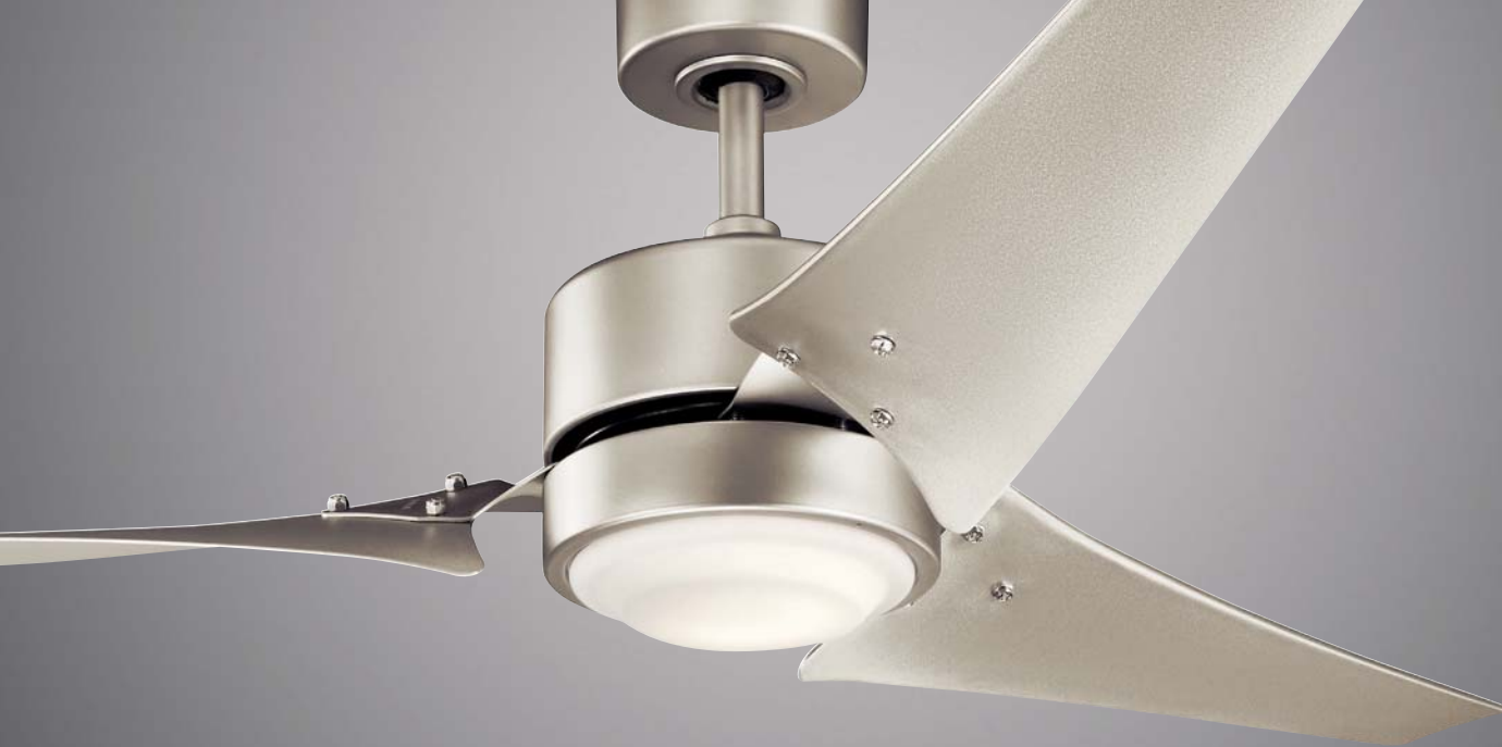
Shown: 310155NI Brushed Nickel Finish, Etched Cased Opal Glass with Nickel Blades