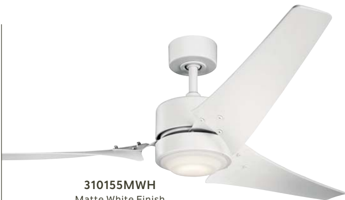
310155MWH Matte White Finish Etched Cased Opal Glass Matte White Blades