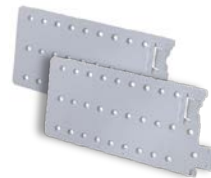
Side Brackets (2)