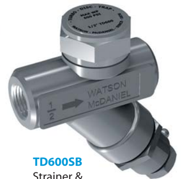
TD600SB Strainer & Blowdown Valve