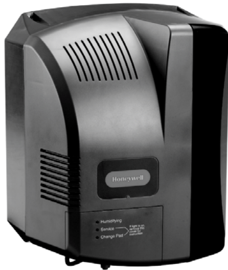
Fan Powered Model