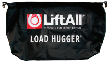
Logistic Strap Storage Bag Part Number 60820

* Tuff-Edge web is Hi-Vis green for all lengths.