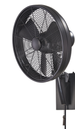
Convertible to Hardware or Wall Plug