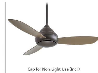
Cap for Non-Light Use (Incl.)