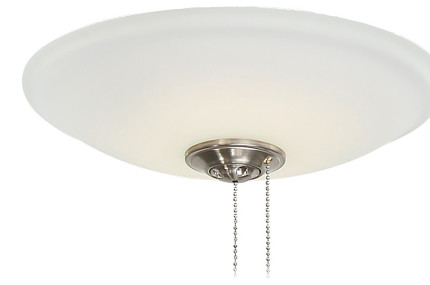
Brushed Nickel and White Caps (Incl)

Item # K9115L UPC Code: 706411056345 Product Family Name: Finish: White Category: LIGHT KITS Category Type: Light Kit Certification 4000048 Patents: Notes: