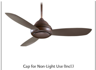
Cap for Non-Light Use (Incl.)