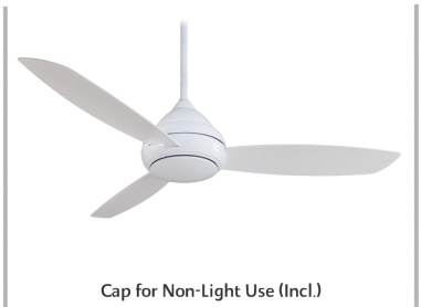
Cap for Non-Light Use (Incl.)